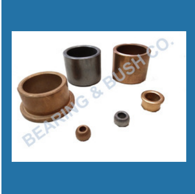
Sintered Bushes & Parts