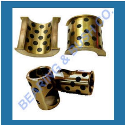
High Tensile Manganese Bronze Bushes