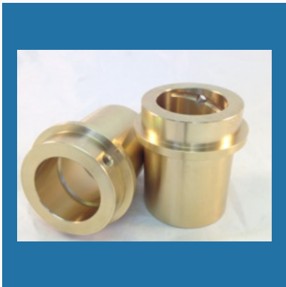
Aluminum Bronze Parts