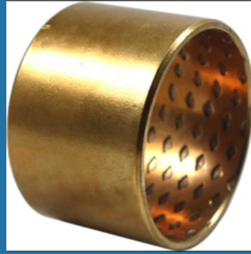
Steel Backed BI Metal Bearings