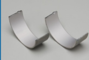
Steel Backed Tri Metal Bearings