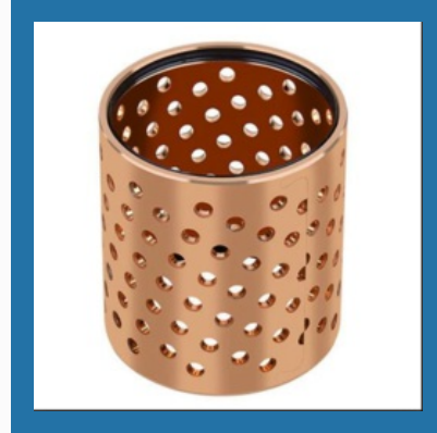
Brass Hot Rolled Sheet