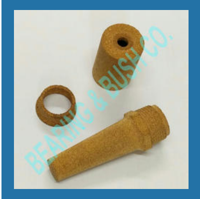
Sintered Bronze Filter