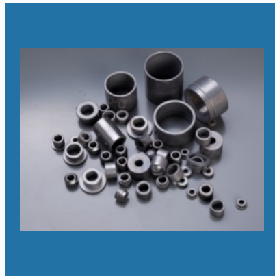
Iron Sintered Bushes