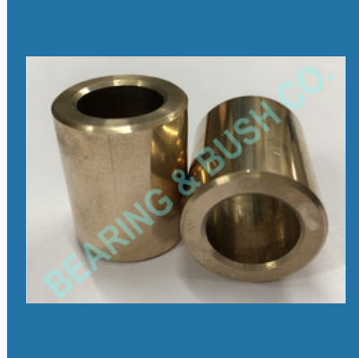
Gunmetal Bronze Bushes