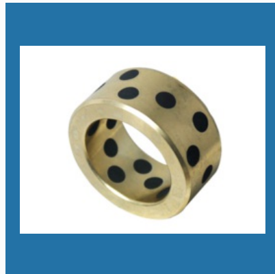
Graphite Bronze Bushes