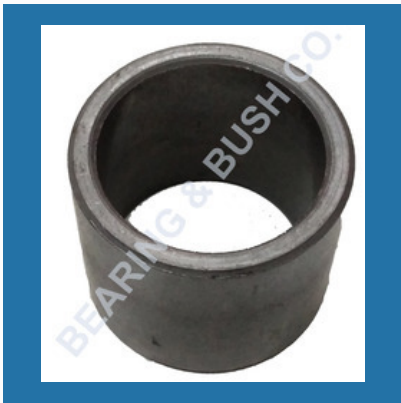
Sintered Iron Bushes