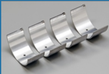
Steel Backed White Metal Bearings