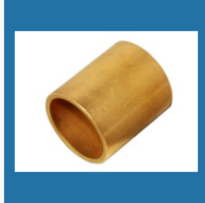
Sintered Bronze Bushes