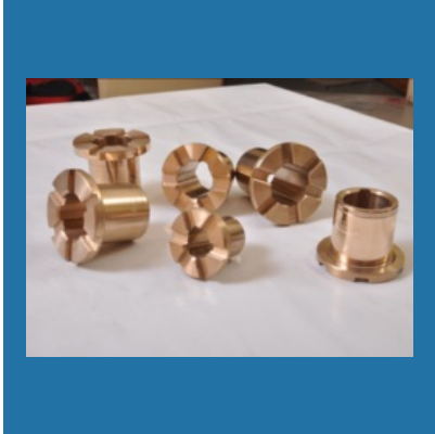
Casted Gunmetal Bushes